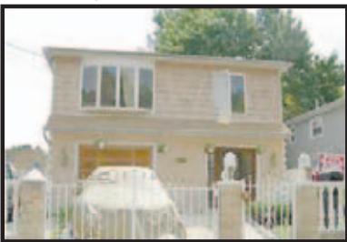
MARINERS HARBOR (MLS#1028145)

Beautiful 4 bedrooms, 1-bath Colonial, Canadian oak floors, finished basement, appliances stay. $414,900