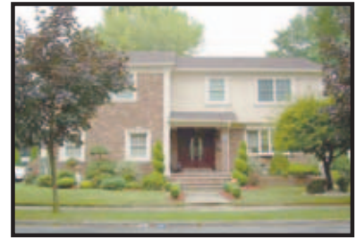
ANNADALE (MLS# 1029194)

Total privacy! Magnificent Center Hall in secluded setting, 4/5 bedrooms, 2-car garage, pool and resort-like grounds. $1,499,000