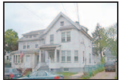
PORT RICHMOND (MLS#1024926)

3 bedrooms, 2 bath detached Colonial on 30' x 100' lot, quiet tree-lined street, large yard. $385,000