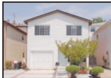
GREAT KILLS (MLS#1027707)

Beautiful, huge 9-room hi-ranch. 4 bedrooms, 4 baths, central air, a finished basement and a garage. Asking $720,000