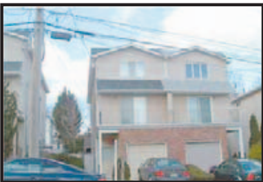
LOWER TODT HILL (MLS#1022908)

Investors delight! 2-family detached, great area, creative financing available. $375,000