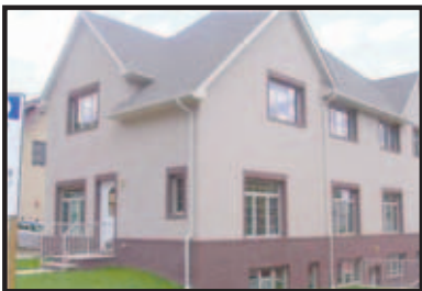
NEW DORP (MLS#1021821)

4 bedroom semi, 3 baths, formal dining room, garage, deck 23' x 100' lot. $459,000