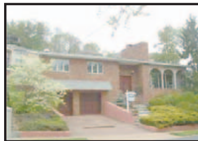
EMERSON VALLEY (MLS#1024854)

Beautiful 2-family detached 6/6, formal dining room w/fireplace, fin. basement & gar. Custom back yard w/pool. $849,900