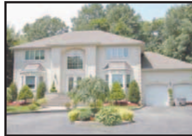
PRINCES BAY (MLS#1026808)

Magnificent 5-bedroom, 4-bath, 2-family Center Hall Colonial on private cul-de-sac w/waterfront view and pool. $1,699,000