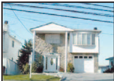
RICHMOND TOWN (MLS#1023518)

Beautifully upgraded Colonial with master suite, finished basement, 2-car garage plus hospitality suite. Asking $729,000