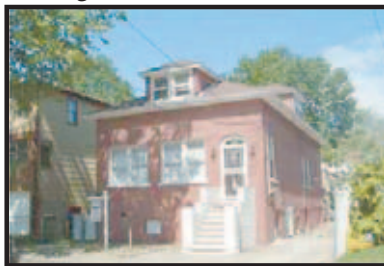
NEW DORP (MLS#1025341)

3-bedroom, 2-bath, 2-family detached on 42' x 115' lot. Jacuzzi, stainless appliances stay. $629,000