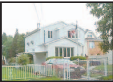
SOUTH BEACH (MLS#1026355)

Great income producer. 2-family, renovated, 3 bedrooms, 2 baths plus 2-bedroom apartment, 40' x 100' lot, great location! $569,000