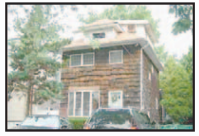
PORT RICHMOND (MLS#1027178)

Spacious 3-bedroom ranch on huge 150' x 82' property bordering nature reserve. $525,000