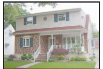
NEW DORP (MLS#1026093)

Custom area Colonial with 11 rooms! 4 BR, 4 BA, deck faces greenbelt, walk to the water! Basement and garage. $779,000