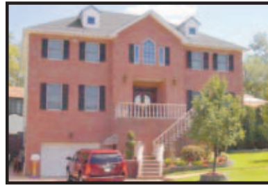
TOTTENVILLE (MLS# 1029245)

"The Unmistakable Choice in Real Estate"